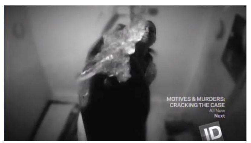
Figure 3. Kelly Silk (Mavety 2012a: Bury Their Babies ). Reproduced with permission

audience; the image also uses the gasoline falling onto the lens to direct attention. Together, the gaze of the subject, the stream of the cascading gasoline, and the upward angle of the shot serve to depict Silk as a powerful, threatening, and somewhat larger than life figure.