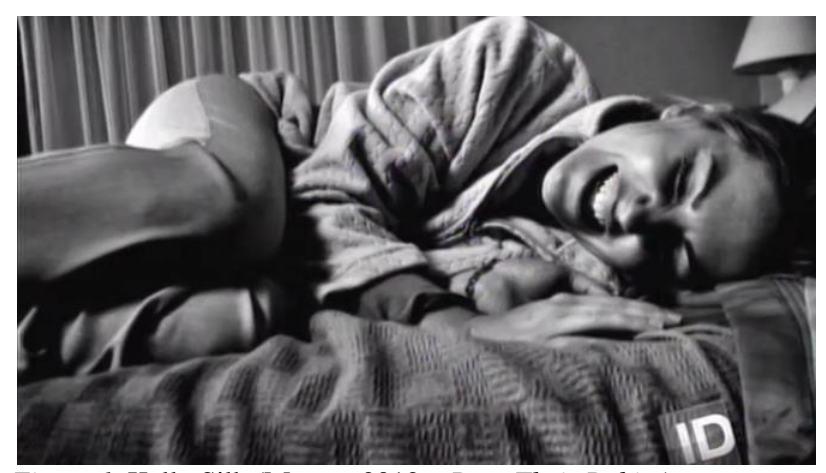
Figure 1. Kelly Silk (Mavety 2012a: Bury Their Babies ). Reproduced with permission.

This shift from moving colour to still black and white image serves to further dramatize the scene and depicts Silk losing emotional control. The black and white also serves to elicit an emotional