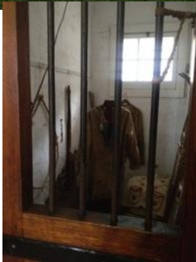
Figure 8.

requiring exposition. The colonial dimensions of incarceration on Manitoulin Island and indeed its pilfering by the Government of Upper Canada prior to Confederation in 1867 and the Government of Canada following it must be unpacked since these aspects of its