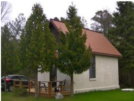
Figure 1.

The next image (Figure 2), which can be found on one of the book shelves in the cottage, depicts a meeting between the owner of the