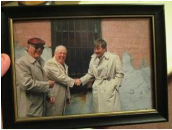
Figure 2. (c) Walby and Piché (Research Team)

lock-up and the then Province of Ontario's Minister of Corrections, who was in the area at the time. This photograph helped us recall the work the owner had engaged in over time, as well as notoriety he attained. It is also reminded us of the work local people and historical societies put into transforming decommissioned carceral sites into tourism destinations (see Walby and Piché 2015b), which shapes how these museums “perform the carceral past in the present” (Turner and Peters 2015: 75).