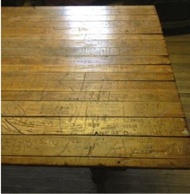
Figure 15. (c) Walby and Piché (Research Team)