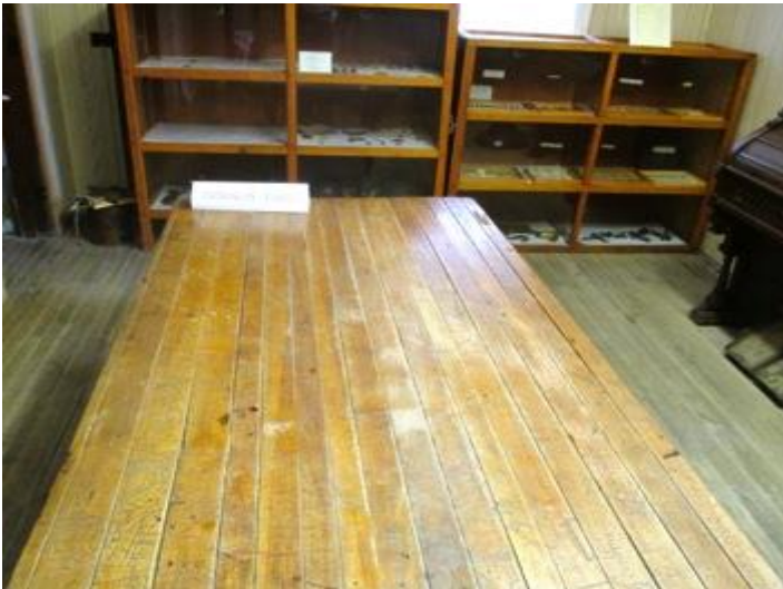
Figure 11.

Yet there is more in the visual that is not knowable. The following set of pictures (Figures 11 to 16) were taken at Gore Bay Museum, which was formerly the Gore Bay District Jail and Court House. They depict a large wooden table, located in what was the small four-cell range for incarcerated men. The curator claims that the table stands in the exact place it stood when the jail was