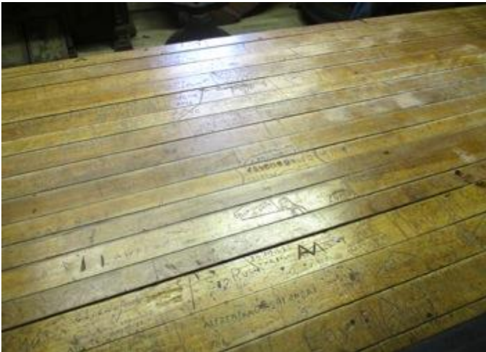
Figure 12.

There are also carvings, such as Figure 16, that appear incomplete. The fragmented image begs many questions: was it an intervention