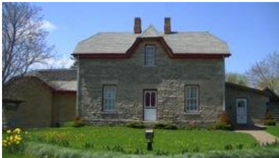
Figure 3.

Figure 3 illustrates the Assiginack Museum Complex, which is in part comprised of what used to be the Manitowaning Lock-up. In fact, the original walls of the old jail are enclosed within newly added building structures. The next image (Figure 4) looks to be of an old jail cell; however, though the cell itself is partly original, it is