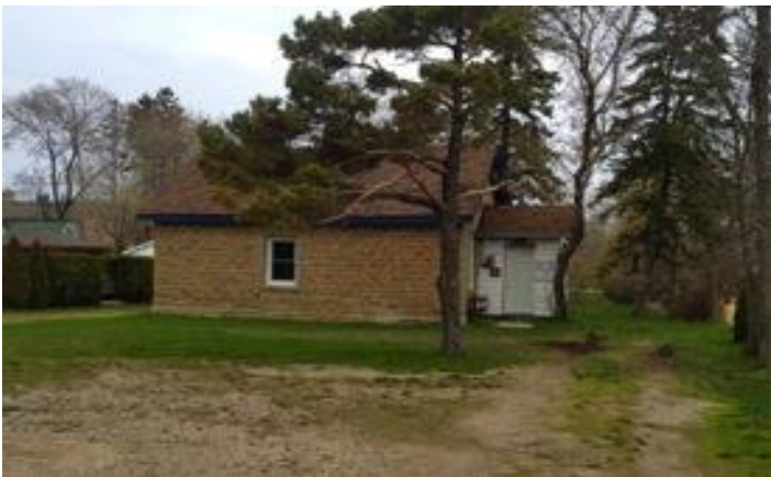
Figure 7. (c) Walby and Piché (Research Team)

Sometimes the visual serves to jog our memories and at the same time is used as data. Figure 7 is from Little Current Lock-up, which has not been retasked as a museum. In fact, passers-by might not even know that it is a former carceral space. The building now serves as a clubhouse and storage for the Navy League. In our analysis of photographs, we had to decide whether or not to incorporate all decommissioned prisons and jails into our typology