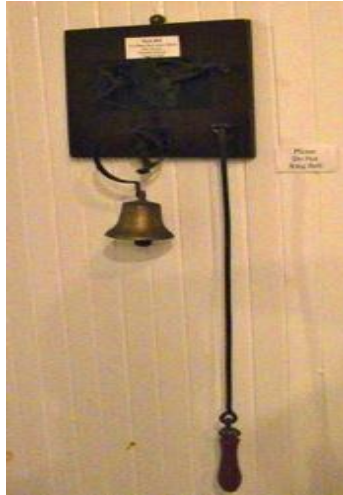
Figure 6.

Sometimes the visual serves to jog our memories and at the same time is used as data. Figure 7 is from Little Current Lock-up, which has not been retasked as a museum. In fact, passers-by might not even know that it is a former carceral space. The building now serves as a clubhouse and storage for the Navy League. In our analysis of photographs, we had to decide whether or not to incorporate all decommissioned prisons and jails into our typology