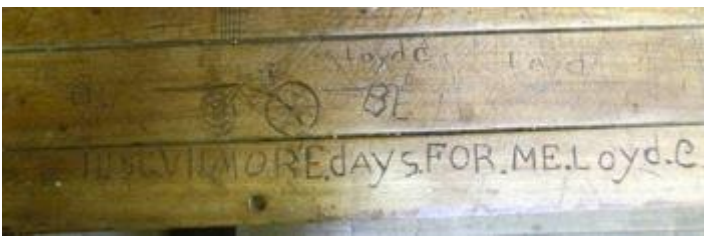
Figure 14. (c) Walby and Piché (Research Team)

from a guard, or from another prisoner, that prevented its completion? Did a fight or perhaps boredom stop the carving's maker from completing their work? Or did the prisoner in question intentionally leave the carving as we found it? If and why these carvings were interrupted can never be known. When we presented a version of this work at the 2015 Visualizing Justice conference ( http://cijs.ca/conference/cijs-event-archive/ ), one audience member stated that it is common in First Nations art to present faceless entities or figures. While we do not deny that depictions of faceless entities are common in First Nations art, this particular figure also lacks a head, feet, hands, half of the arm, and half of the club.