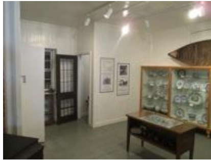
Figure 4. (c) Walby and Piché (Research Team)

not in its original location. The cell was moved from elsewhere in the building and partially rebuilt. This picture reminded us of the cell's manipulation. This staging of authenticity involved a combination of what is elsewhere called the "carceral stage setting" strategies of creation ("based on the imaginations of those involved in museum curation") and preservation ("freezing the heritage aspects of the site") of a cell (Walby and Piché 2015c: 237). The picture informed not only our writing about the Assiginack Museum Complex specifically, but our understanding of staged authenticity at such museums generally.