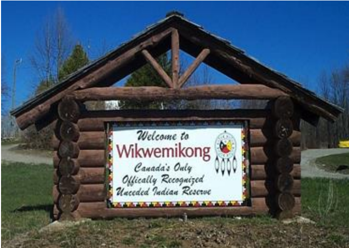
Figure 9. (c) Walby and Piché (Research Team)

receive 25 acres per family in return. The commissioners of Crown Lands returned in 1862 to make a new treaty. Some First Nations groups resisted these interventions. The commissioners decided to promise supplementary sums of money and 100 acres more per family. Some Chiefs accepted the agreement, but the Wikwemikong people did not agree and were not included in the treaty. Stemming from this resistance to government commissioners, the Wikwemikong peninsula “remains one of two unceded portions of land” (Surtees 1986: 20; also see image above) in Ontario. The 1862 treaty reversed the 1836 treaty. In the decades following the treaty of 1862 and Confederation in 1867, the federal Department of Indian Affairs would advertise parcels of land available on Manitoulin “for sale to actual settlers ” (Jacobs 2012: 71 [emphasis added]).