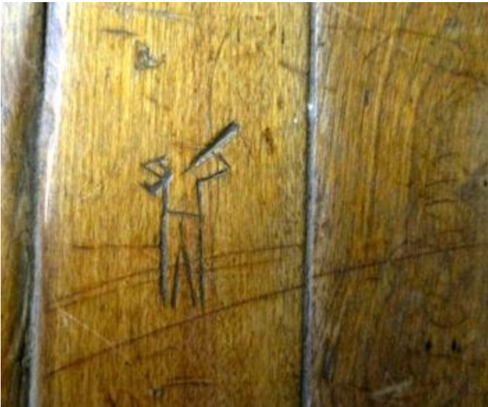
Figure 16. (c) Walby and Piché (Research Team)