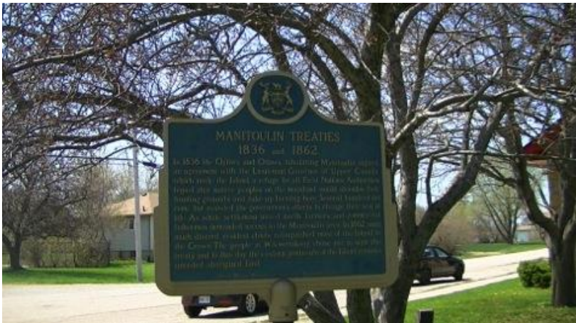
Figure 10. (c) Walby and Piché (Research Team)

The silences described above are striking in that “[a]ll the oppression of Aboriginal peoples in Canada has operated with the assistance and formal sanction of the law,” which Indigenous activist and educator Patricia Monture (1995) argues “is at the heart of what we must reject as Aboriginal nations and Aboriginal individuals” (250). And this is not simply about the past as it is memorialized either (e.g., Figure 10). It is also about (mis)representations of the present that fail to document the ongoing nature of the Canadian project of colonization that entails an “indigenization of corrections” involving the provision of so-called Aboriginal programs and the hiring of First Nations staff (see Martel et al. 2011) that sees Indigenous peoples generally, and women in