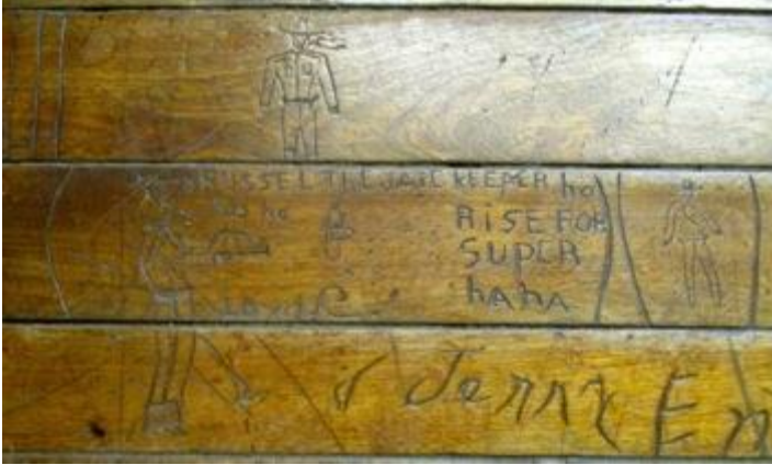
Figure 13.