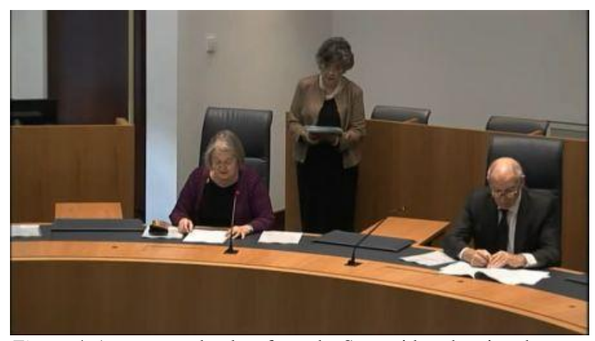
Figure 4. A screen grab taken from the Scott video showing the medium establishing shot. Reproduced with permission.

The other "new" shot, used in two sequences, is an over-the-shoulder close up of the speaking judge (E). This close up (Figure 5) differs from the medium close up in two ways. First, it is much more like the traditional close up used in film and television, in which the head and face dominate the screen. But it is far from being a traditional close up in which the full face dominates. Here the judge's face is in profile. The angle and position of the camera produces a fore-shortened side view of the judge's head in which only a small part of the side of the face is visible. The rest of the frame is filled with the detail of the speaker's immediate surroundings and more specifically the surface of the desk the judge sits at and objects on the desk.