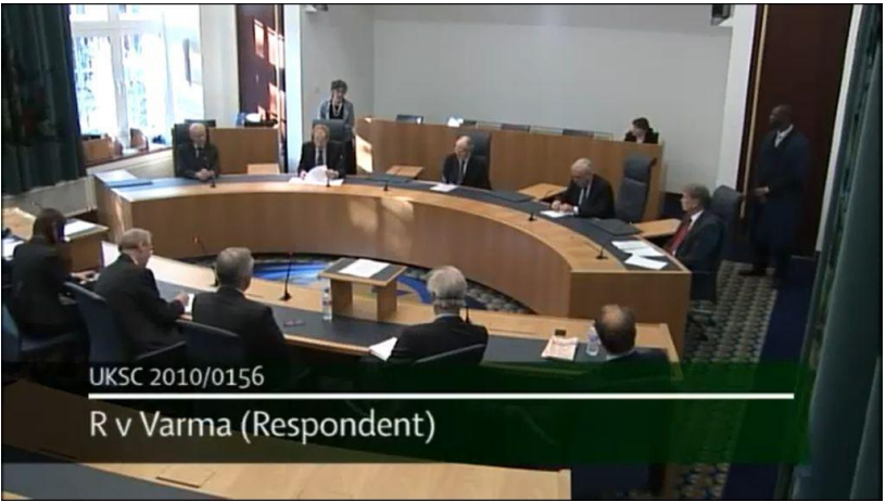
Figure 1. This screen grab is of the first establishing shot taken from the summary judgment video for R. v. Varma . Note the courtroom cameras visible at the top of the picture placed high in the alcove behind the judges. The title of the case on screen provides a visual prompt to facilitate a particular reading of the location depicted in the screen image as a courtroom. Reproduced with permission.

The image that follows the first editorial cut has a wide angle (Figure 1). It shows a room. Sunlight comes through a window at the top left of the frame of the screen. Two gently curving desks fill the majority of the screen: one facing the other. Papers are neatly organized on the desks. Both desks are populated. One is occupied by a group of five people facing the camera. All are dressed in business attire. The second desk, positioned closer to the plane of the image is cut off at the left by the frame of the screen. Only the backs of the individuals sitting at this desk are visible. A woman stands behind the five who face the camera and to the left of the screen. Behind her, an alcove containing a wooden paneled desk includes another seated figure. The only other person in the frame is