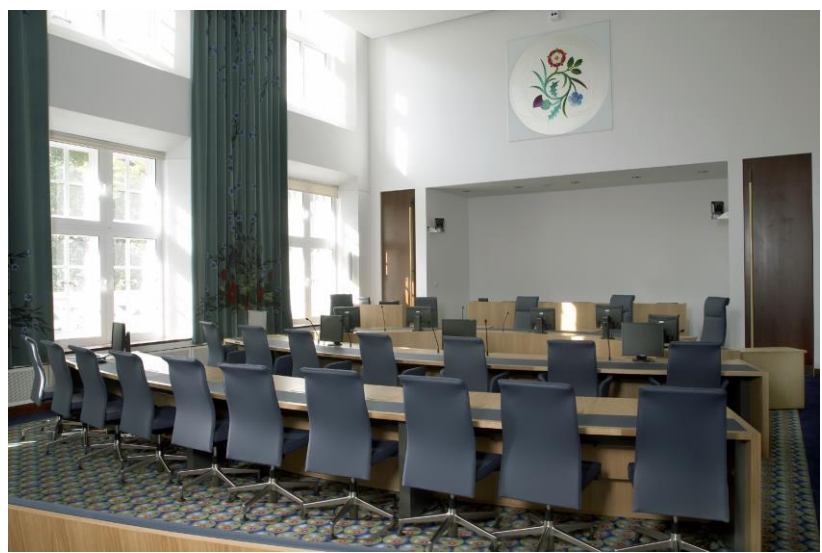
Figure 2. Court 2 showing the position of the court emblem on the wall behind the judges. The carpet of the court also incorporates a stylized representation of the floral composition at the centre of the court's emblem. Two of the court's four cameras are visible in the alcove.

In the first instance there appear to be few visible symbols within the frame of this shot to mark the space as a courtroom or any of the figures within it as judges. For example the Court's symbolic badge (Figure 2), a visible marker that designates the space, is cut off by the edge of the screen's frame. The only figure wearing a robe is at the margins of the frame, standing apart from the others at the top right, in front of a door; the costume is indistinct. This positions him